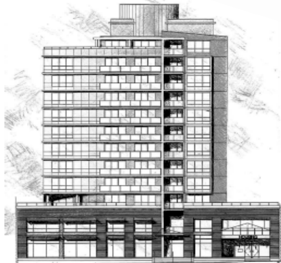
Original architecture rendering of the Drop-In Center

A fter several months of hard work and debate the first Clubhouse Council has been elected. The Council will be responsible to make recommendations on program direction at the Clubhouse, develop relevant educational opportunities for members and staff on subjects of common interest, facilitate formal evaluation processes on Clubhouse programs and respond to expressed concerns and needs of Clubhouse members. The process of a Steering Committee composed of staff and members to develop terms of reference and run an election has been an exciting one. The council is composed of seven elected member reps and five staff and will formalize the value the Clubhouse has in staff and members working side by side to provide service and solve problems. ■